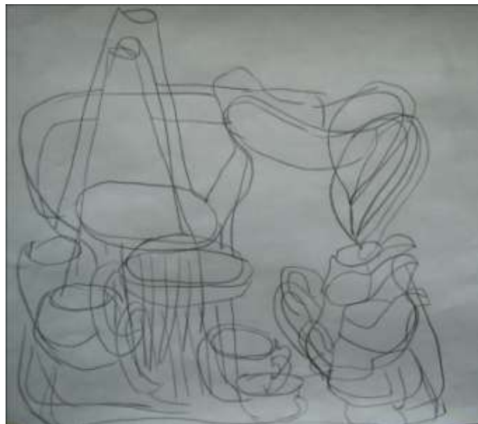
Above: Still life objects and a multiple blind contour drawing