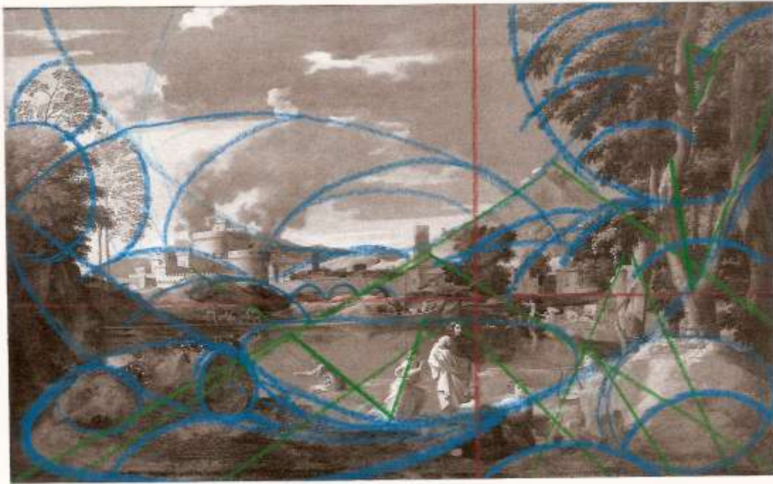
Nicolas Poussin Landscape with Orpheus and Eurydice